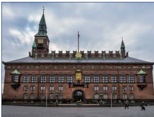
KØBENHAVNS RÅDHUS The City Hall of Copenhagen / Hotel de Ville, Copenhague