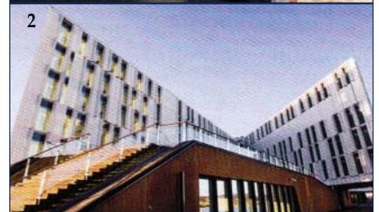
1: UN City, Marmormolen, Nordhavn, Copenhagen. 2: FN Byen, Inaugurated by H.M Queen Margrethe 2, on July 4, 2013.